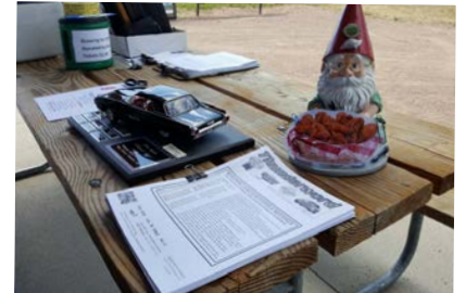
John Saylor Award